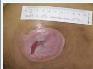
Fig 2: Improvement in the wound after seven months