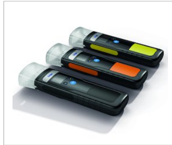
Optional reflector film set (yellow or orange)