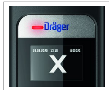
"Alcohol Detected" symbol