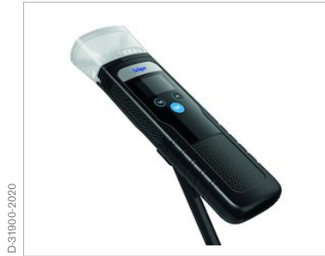
1/4" thread for mounting a selfie stick