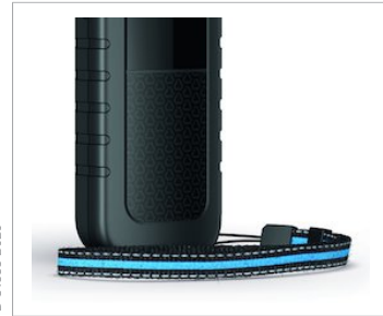
Grips and wrist-straps for secure holding