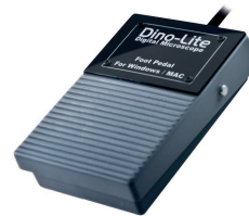
SW-F1 footpedal - capture handsfree