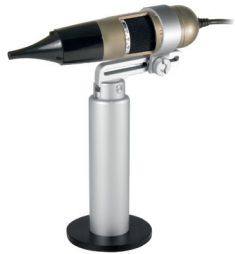
HDE-01 EarScope holder

Pictures made with Dino-Lite can be stored in the Electronic Patient File simply by means of 3 mouse clicks. I can easily add pictures to my 'library' of ear affections. A picture says more than many words; the emergency of a patient's case can be judged very quickly. I am very fond of visualization."