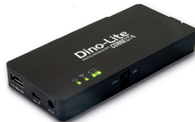
WF-10 work wirelessly