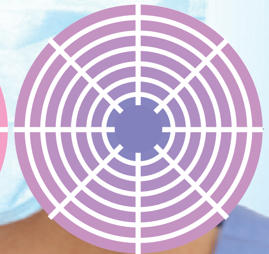
Sterilized, result large Fail Major reject Call in technical service